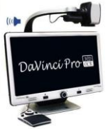
CCTV Da Vinci - OCR