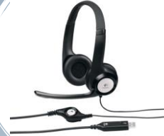
Logitech USB Headset