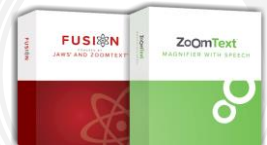
Fusion Pro Jaws/Zoom Text