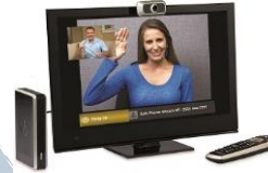
Sorenson Video Relay