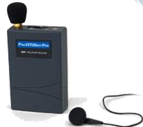
Pocket Talker PRO